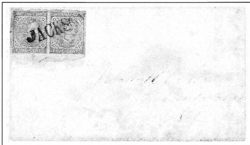
Figure 2. A pair of local printing 5¢ typographs (Scott #7) are cancelled here with a straight line JACKSON marking. Jackson was one of only a few towns to use a straight line postmark. The cover is addressed to Mrs W.H. Carter, Walnut Cove, N.C.

overtake the city. With his command he marched on the city on May 15 and occupied it with little resistance. General Sherman ordered General Mower to be military governor of Jackson and proceeded to destroy all facilities that could benefit the war effort. With the discovery of a large supply of rum, it was impossible for Mower's brigade to keep order among the mass of soldiers and camp followers, and many acts of pillage took place. General Grant left Jackson on the afternoon of the 15th and proceeded to Clinton. On the morning of the 16th he sent orders for Sherman to move out of Jackson as soon as his destruction was complete. Sherman marched almost immediately clearing the city by 10 a.m. By nightfall on May 16, Sherman's corps had reached Bolton, Mississippi and the Confederacy had reoccupied what remained of Jackson. Jackson had been destroyed as a transportation center, her war industries were crushed and most importantly the Confederate concentration of men and materials aimed at saving Vicksburg were scattered to the winds.